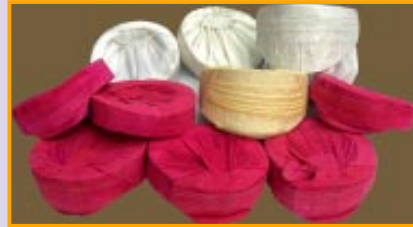
Paag (Cotton & Silk) Price : Rs. 30 - 100

A traditional headgear of Mithila, Paag is worn on every special occasion or rituals. About two decades ago this