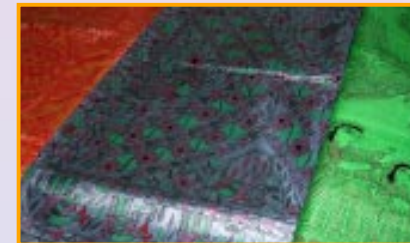
Silk Sari Price : Rs. 1800 - 2500