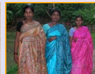
Dupatta (Cotton & Silk) Price : Rs. 300 - 650

There are basically two recognised centres of Madhubani Painting Viz. Ranti (2 Kms east of Madhubani) and Jitwarpur (2.5 Kms north of Madhubani). Right from the 1960s Ranti has been known as the largest and most authentic centre of Mahubani Painting.