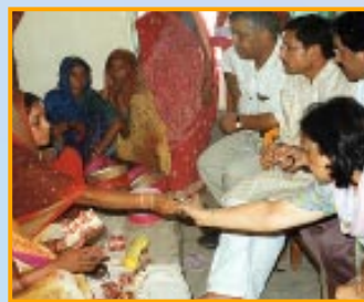
Lac Bangles Price : Rs. 50 - 300 (Per set)

Lac is used to make bangles of various colours and hues.