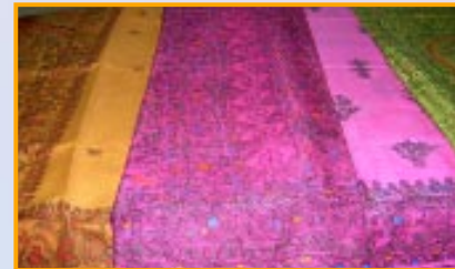
Cotton Sari Price : Rs. 900 - 1200