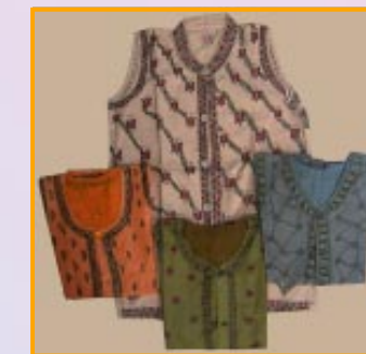
Jacket & Shirts Price : Rs. 150 - 500

GVP has got a training centre at Ranti to impart training to Women of all the castes residing in all 137 villages covered by the various programmes taken up by GVP. They make beautiful paintings and earn their livelihood by selling them directly or through the marketing channel