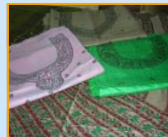
Salwar Suit (Cotton & Silk) Price : Rs. 1000 - 1500

There are basically two recognised centres of Madhubani Painting Viz. Ranti (2 Kms east of Madhubani) and Jitwarpur (2.5 Kms north of Madhubani). Right from the 1960s Ranti has been known as the largest and most authentic centre of Mahubani Painting.