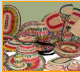
Sikki Price : Rs. 50 - 1000

Sikki is a special variety of grass grown in the region. It is used to make decorative items, small utensils, flower vase, bangles, purse, toys, etc.